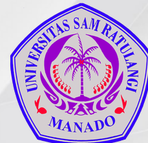
Universitas Sam Ratulangi