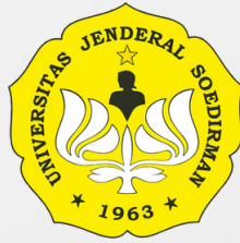
Universitas Jenderal Soedirman